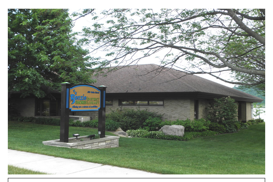
View of the library showing the final addition which was constructed in 1994 (northwest corner from Main Street).