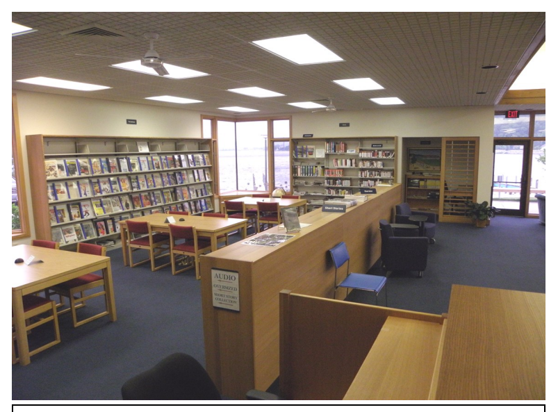
Teen and media area reconfigured for enhanced study/reading space.