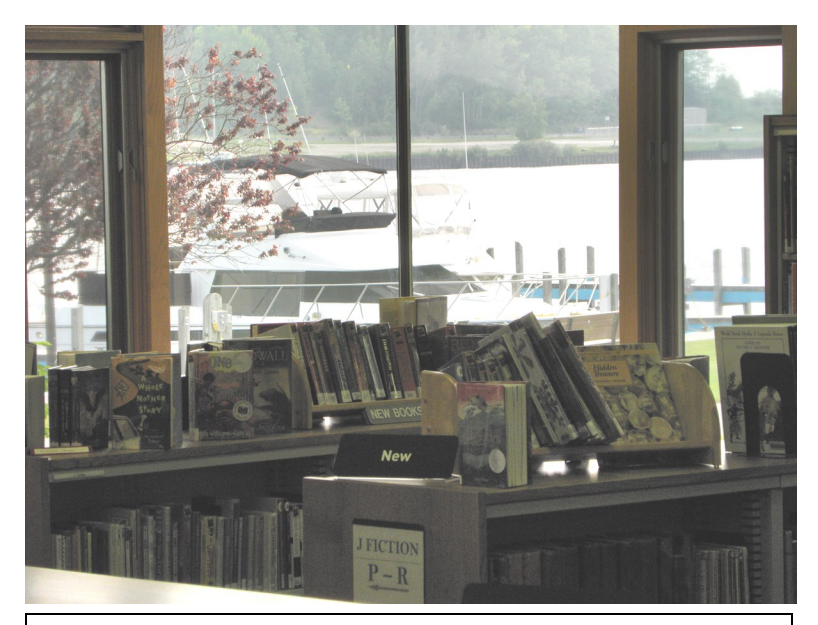
New children's area located in the southwest corner of the library with a lovely view of the bay.