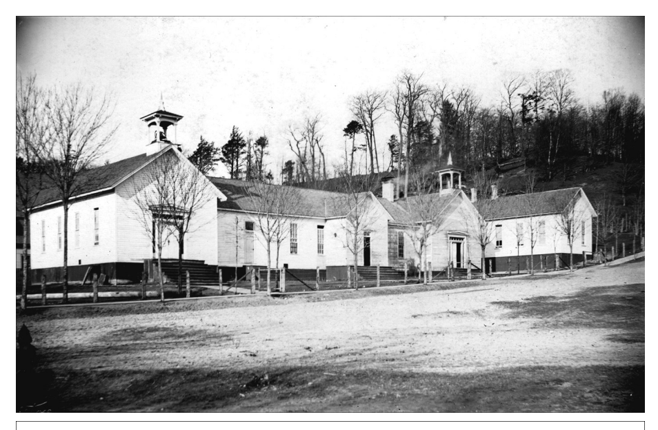
In the late 1930s this long building with three doors housed (from left to right) Benzie County Normal, the Frankfort Library, and a meeting room for community activities. (c.1909)