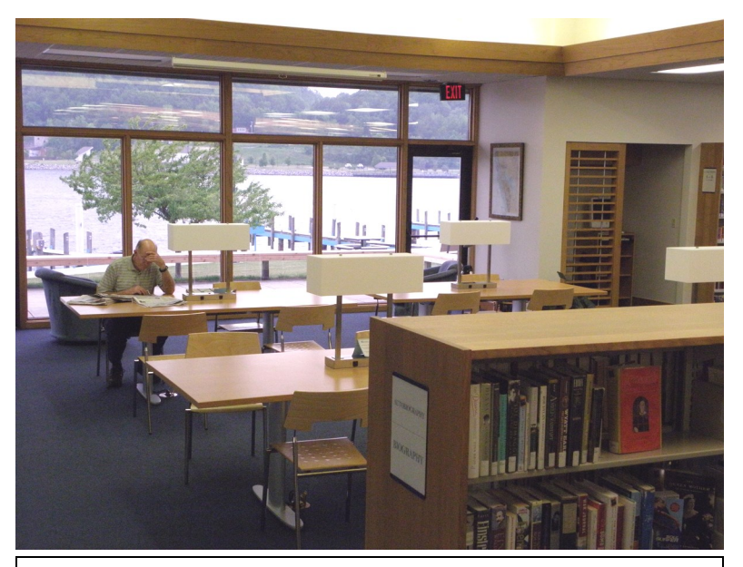
Spacious new study area with its lighted tables and ever changing view of Betsie Bay.