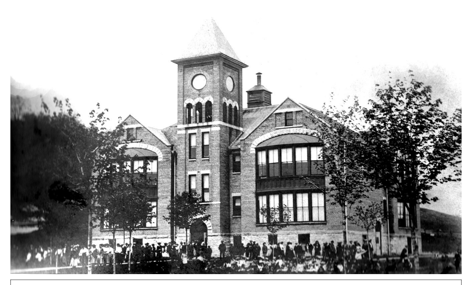
In September, 1898, the Crystal Lake Township Library and the Frankfort Literary Society combined their collections to form the Frankfort Public School Library, which was located within the school on Leelanau Avenue.