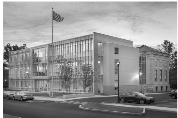
Renovated & Expanded Library – 2014-