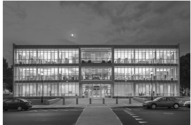
Chestnut Street Now –