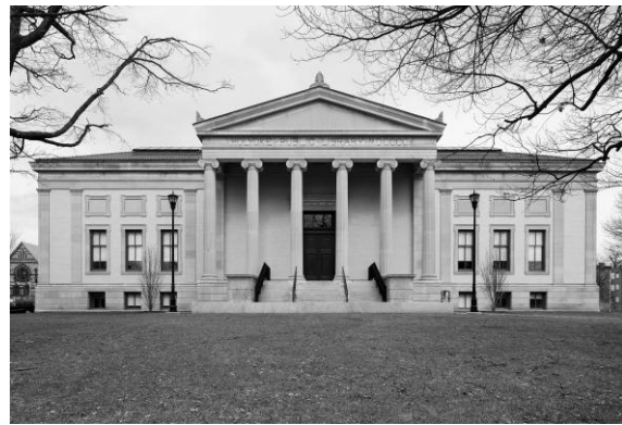
Maple Street Now --