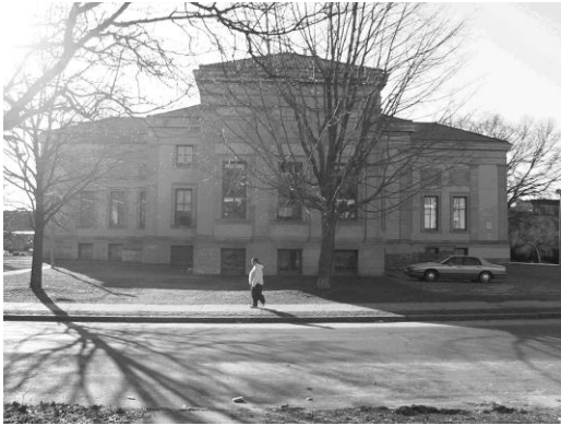
Chestnut Street – before 2012