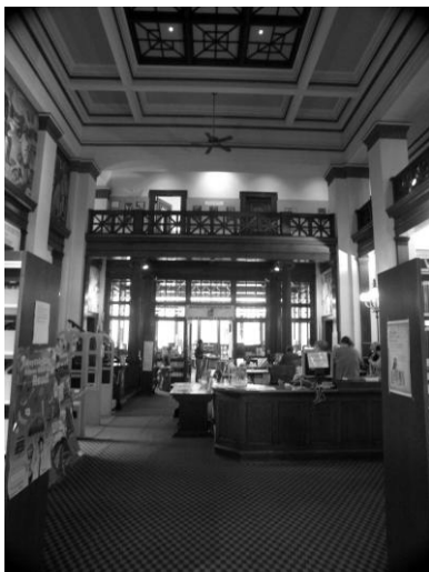
First Floor – before 2012