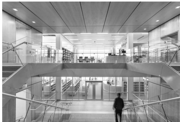
Reference and Children's Rooms --