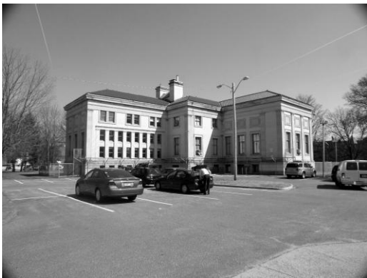
Original Library from 1902-2011