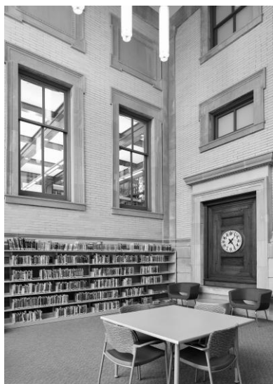
New Teens' Room – 2014