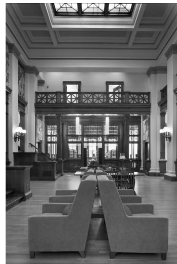
First Floor Now –