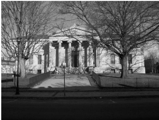
Maple Street – before 2012