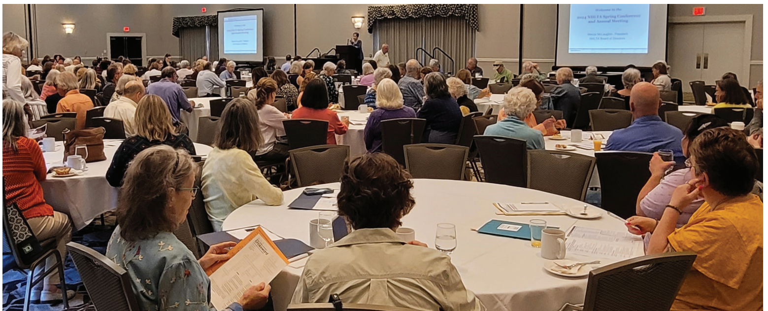
The Annual Meeting