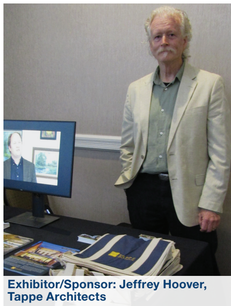
Exhibitor/Sponsor: Jeffrey Hoover, Tappe Architects