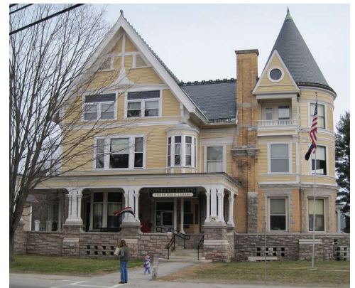
Fuller Public Library, Hillsborough NH