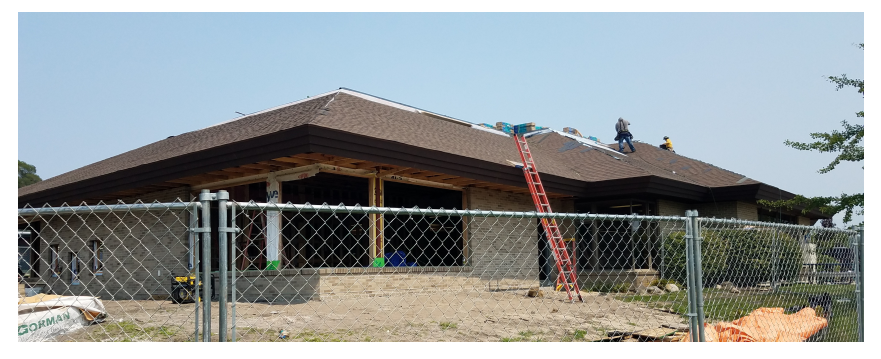
Visit <a href="http://donate.benzieshoreslibrary.org/">http://donate.benzieshoreslibrary.org/</a> for more information about our BIGGER little library!

There has been a lot of noise in the library lately. We've had roofers, carpenters, electricians and masons hard at work the past few weeks. The noise hasn't phased us as it is the sound of progress!