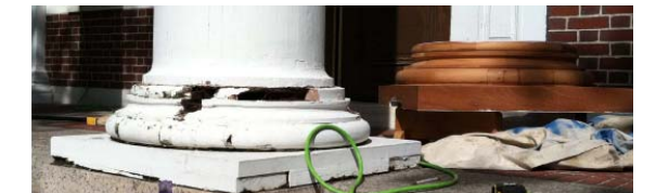
Pictured: the old base and the new, replacement base. Note the missing wood that has rotted away on the old base.

KFL, along with five other Kennebunk businesses and churches, is a recipient of a Community Development Block Grant, administered by the Town of Kennebunk. The Town was granted $115,000; the Library received $46,500 and will reimburse the Town for half that amount, $23,250 from its endowment. The scope of the grant focuses on the Library's front columns: replacement of the plinths and bases, spot woodwork repair, removal of column paint and subsequent sealing and repainting. The project is scheduled to be completed by early September.