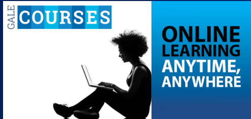
Online Non-Credit Courses Tutorial