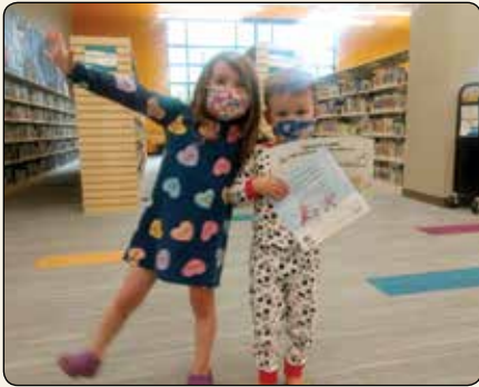
Photo Policy: Attendance at library programs and events constitutes consent to be photographed for White Lake Library publicity purposes.