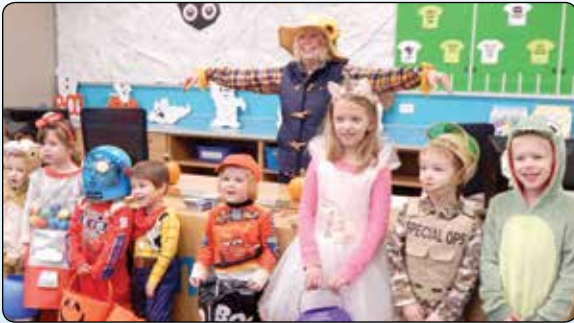
Photo Policy: Attendance at library programs and events constitutes consent to be photographed for White Lake Library publicity purposes.