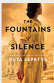
The Fountains of Silence by Ruta Sepetys