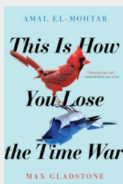
This is How You Lose the Time War by Amal El-Mohtar and Max Gladstone