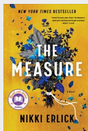
The Measure by Nikki Erlick