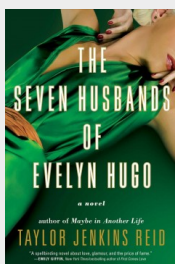
The Seven Husbands of Evelyn Hugo by Taylor Jenkins Reid