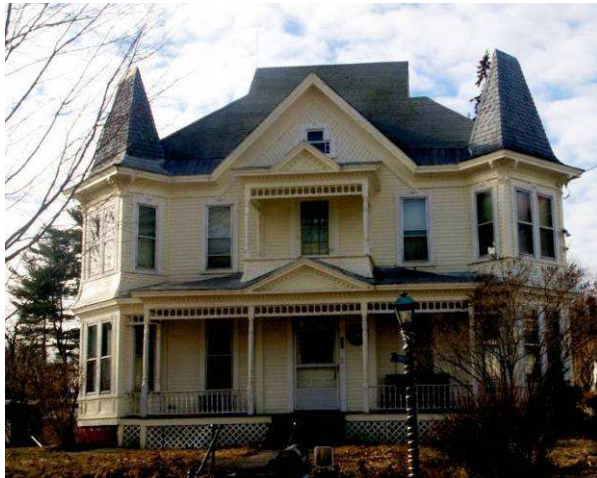
Kroeger House (Marcroft)