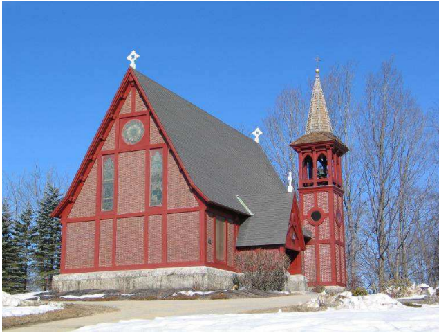
St. Mark's Church

The exterior of the Town Hall has seen little change since 1982; the most important alteration being the construction of a new entrance for the Police Station on the north side of the building, which was completed in 1997. Thanks to a federal and state grant supplemented by local fundraising, the Railroad Station was restored and renovated in 1997-98. The exterior was restored to its original appearance with the re-creation of a door, a window, and part of the trackside platform, which had all been removed. Since 1999, the building has served as a railroad history museum operated by the Ashland Historical Society.