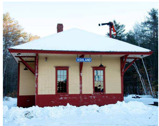
Ashland Railroad Station