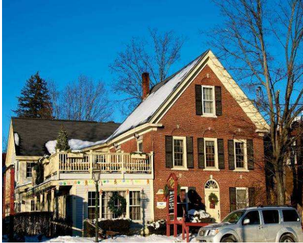
Common Man Restaurant