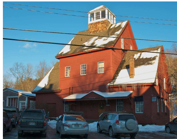
Ashland Grist Mill