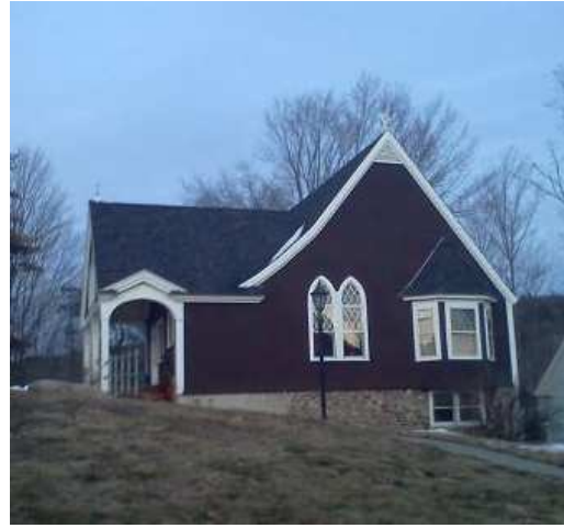
St. Mark's Parish House

St. Mark's Church had its chimney replaced in 1995 and its tower rebuilt and restored to its original appearance in 1998-99. The 2005 renovations of the parish house included handicapped access and a new entrance porch.