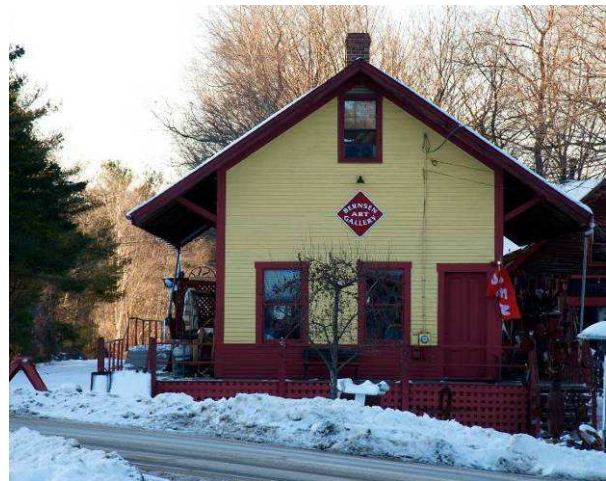
Artist Express Depot

The Scribner Mill is now used for storage and most of the windows are boarded up and the tower entrance has been bricked in. The porch on the eastern side of the Artist Express Depot has been enlarged with new decks on three sides and a sliding glass door added to the northwest side of the building.