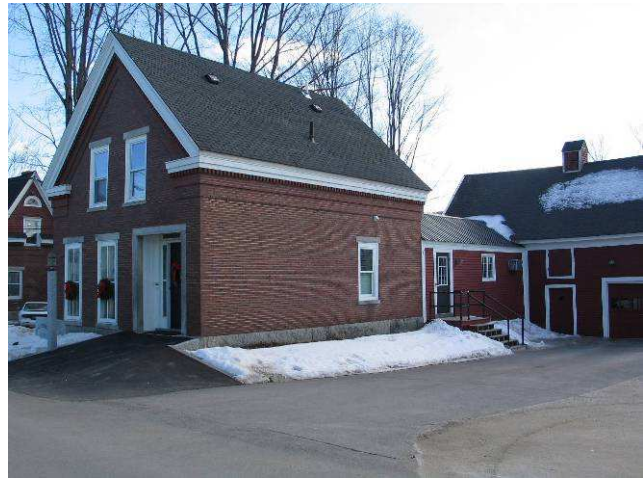
Harold C. Proulx House (Dupre)

The Common Man Restaurant has had additions on the west side to enlarge the dining room and on east side to enlarge the kitchen. A fire escape was added on the east side, and the entrance has been moved from the street front to the west side facing the new patio. The Proulx House (Dupre) has seen only minor changes, such as replacing the front steps with a ramp. The front steps have been replaced by an asphalt ramp, the porch converted to work spaces with new siding and windows, and many windows have been replaced.