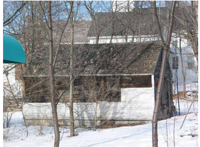
Rueben Whitten House

The White Mountain Country Club has had some modifications, including a new chimney, vinyl siding, replacement windows and doors, and the removal of solar panels from the roof. The Rueben Whitten House is still awaiting restoration.