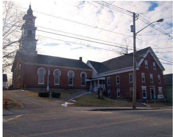
First Free Will Baptist Church

The old school was acquired from the Ashland School District by Tri-County Community Action Program (TCCAP) in 2008. It was restored and renovated in 2009-10, maintaining many of its essential architectural qualities. Exterior changes included new windows and front steps, the remodeling of the side entrances, and the addition of a rear entrance with porch. The school now houses TCCAP offices, meeting rooms, and a Headstart classroom. The Baptist Church proper has seen little exterior change beyond the 1993 installation of a wheelchair ramp. The vestry saw the replacement of windows in 1993 and the addition of a