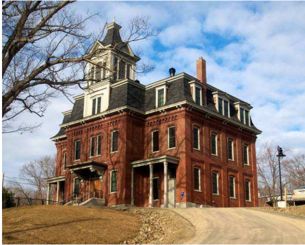
Historic Ashland School