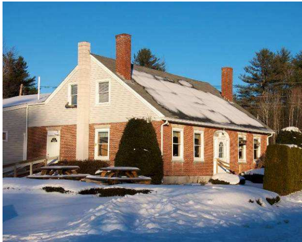
White Mountain Country Club