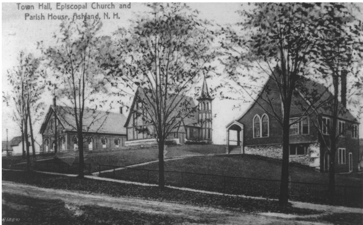
Ashland Town Hall, St. Mark's Episcopal Church and Parish House