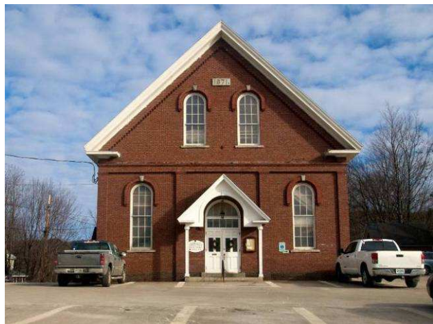
Ashland Town Hall

The old school was acquired from the Ashland School District by Tri-County Community Action Program (TCCAP) in 2008. It was restored and renovated in 2009-10, maintaining many of its essential architectural qualities. Exterior changes included new windows and front steps, the remodeling of the side entrances, and the addition of a rear entrance with porch. The school now houses TCCAP offices, meeting rooms, and a Headstart classroom. The Baptist Church proper has seen little exterior change beyond the 1993 installation of a wheelchair ramp. The vestry saw the replacement of windows in 1993 and the addition of a