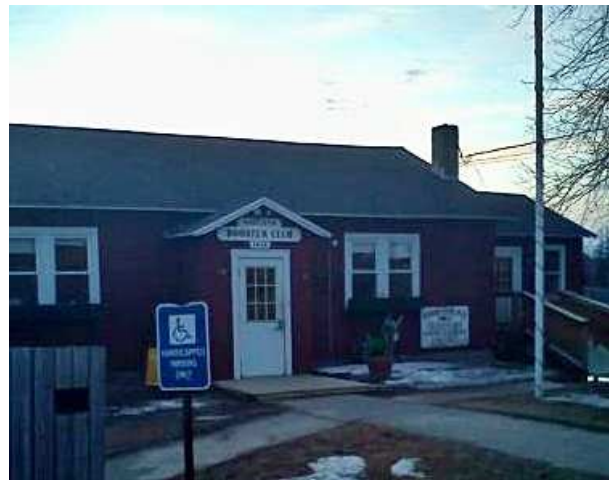
Ashland Booster Clubhouse

In discussions with members of the Ashland Planning Board, it was noted that Memorial Park, churches, and the current Ashland Elementary School are places where individuals and families gather. Additionally, there is the Booster Club, the community center run by the Parks and Recreation Department that hosts several organizations and community events.