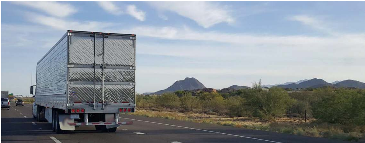
Figure 5. Photo. Interstate trucking -- an essential part of the Nation's economy.