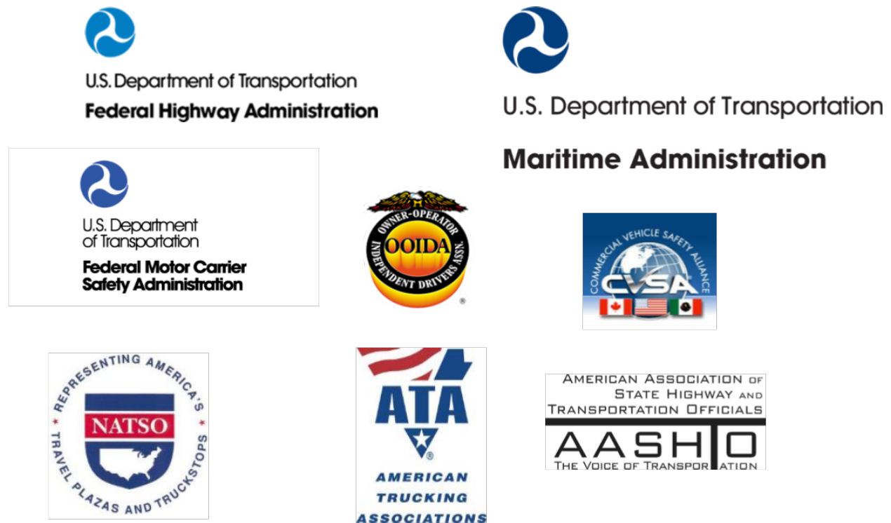
Figure ES-1. Illustration. Organizations and agencies participating in the National Coalition on Truck Parking.

The results and findings of the regional meetings conducted as part of this effort are suggestions and proposals received by participants at the meetings. As such, they should not be interpreted or viewed as recommendations of USDOT, FHWA, or the associations that participated in the National Coalition on Truck Parking.