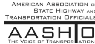
Figure 4. Illustration. Organizations and agencies participating in the National Coalition on Truck Parking.