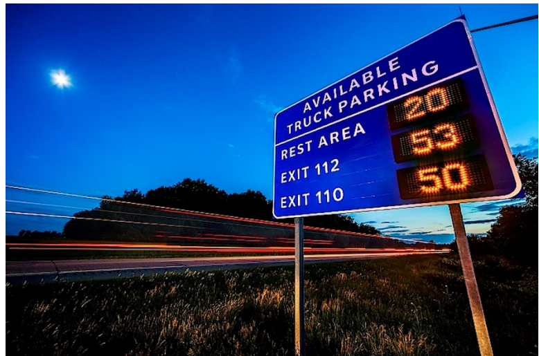
Figure 8. Photo. Truck parking information and management system on I-94 in Michigan.