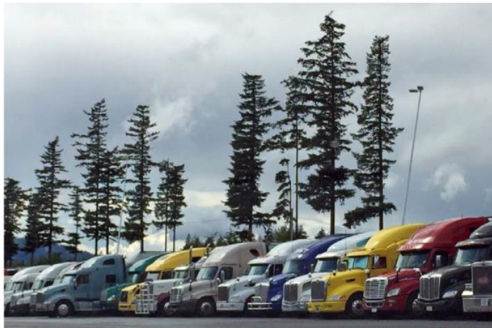
Figure 1. Photo. Truck parking facility in Washington State.

Truck parking demand is driven by safety considerations and the need for adequate rest for commercial vehicle operators. The Federal Motor Carrier Safety Administration (FMCSA) hours-of-service (HOS) rules establish the operating capabilities of a truck driver, including rest time. These rules have undergone a number of changes since 2000, with a focus on improving safety through longer continuous rest periods for drivers. The U.S. Department of Transportation (USDOT) and various State and regional government agencies conducted various studies of truck parking demand and capacity constraints during that time. The Study of the Adequacy of Truck Parking Facilities , conducted in 2002 by the Federal Highway