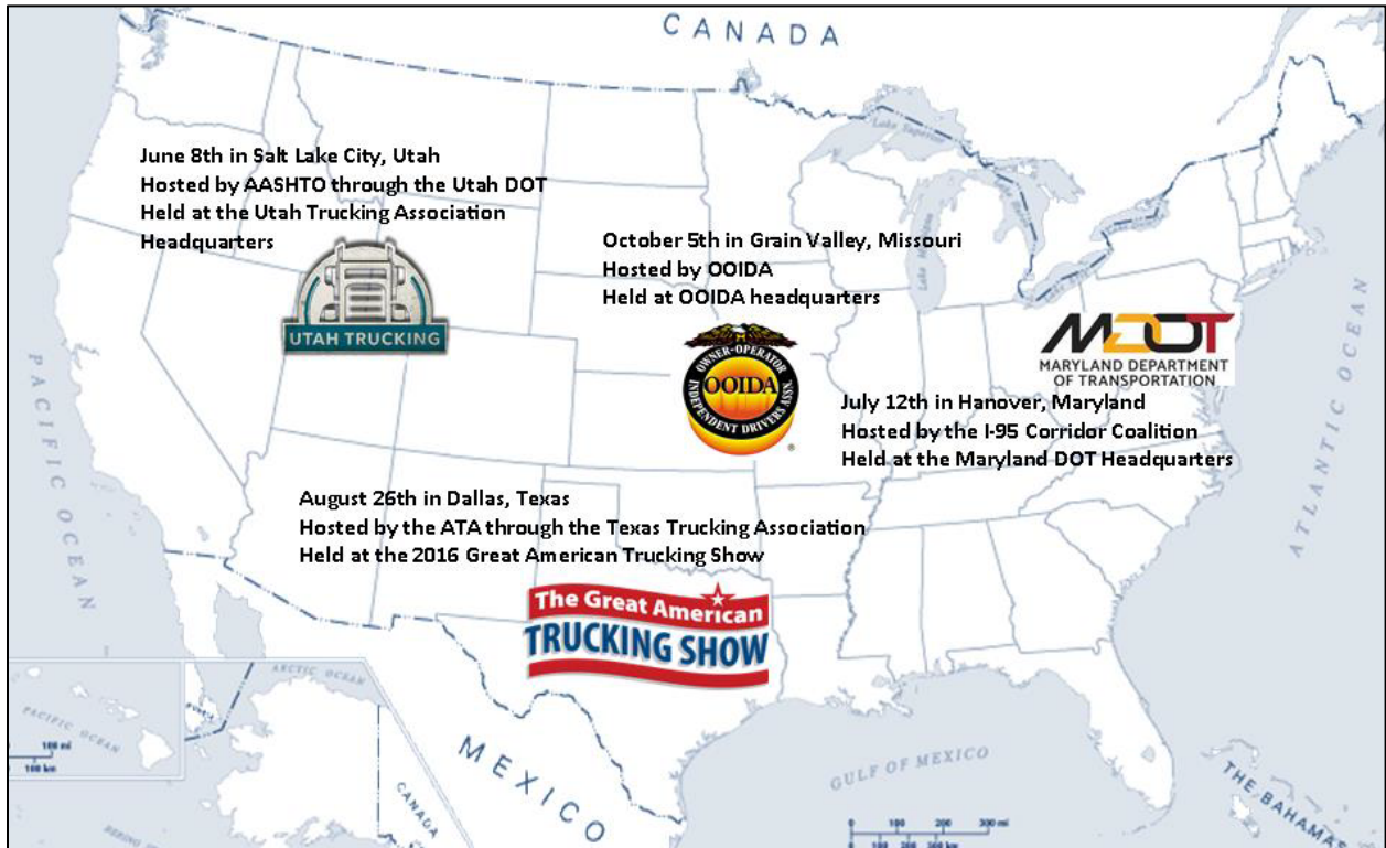
Figure 6. Map. Locations of the 2016 regional meetings.