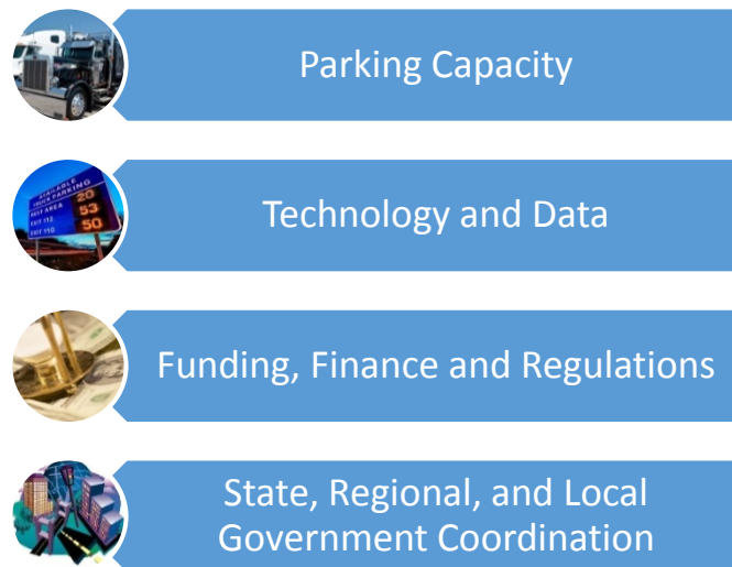
Figure 2. Diagram. Topic areas addressed at the regional meetings.

At the regional meetings, participants shared their ideas on the following four discussion areas, which were identified during the November, 2015 Coalition kick-off meeting: