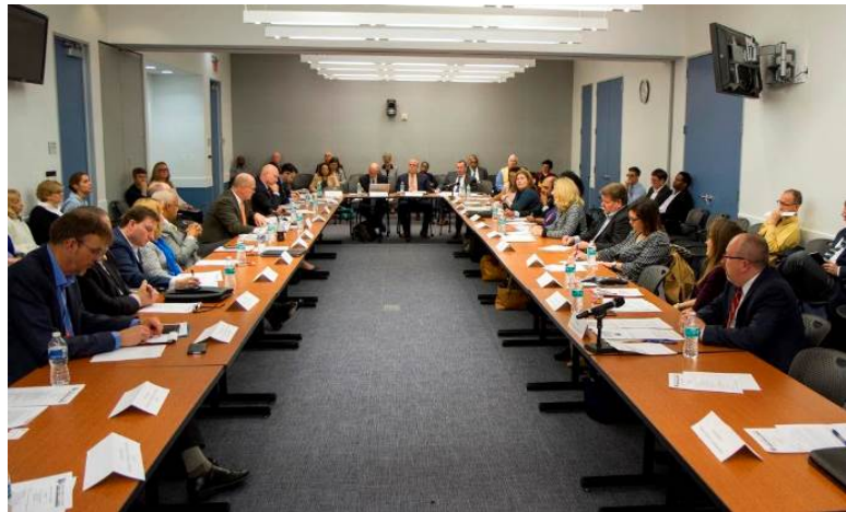
Figure 11. Photo. Meeting of the National Coalition on Truck Parking at U.S. Department of Transportation on December 12, 2016.

The FHWA Office of Freight Management & Operations provided a summary of the truck parking response from USDOT, including a review of Federal funding eligibility for truck parking projects, the analysis derived from the Jason's Law survey and report that was released in August 2015, and the Coalition's regional meetings in 2016. FHWA then facilitated a discussion of the key themes and recommended initiatives from the regional meetings.