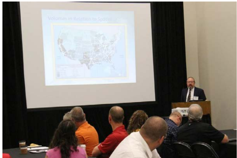
Figure 9. Photo. Dallas, Texas. Regional meeting hosted by the ATA through the Texas Trucking Association and held at the 2016 Great American Trucking Show.