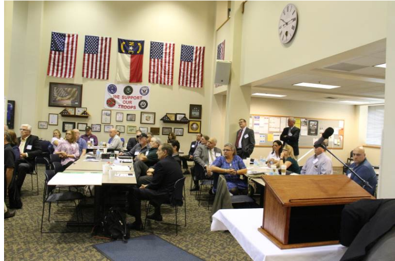
Figure 10. Photo. Grain Valley, Missouri. Regional meeting hosted by Owner-Operator Independent Driver Association at their headquarters.

This item relates to the potential shipper/receiver collaboration in truck parking discussed in Topic Area #1 -- Parking Capacity. National and State associations of counties and municipalities could offer venues for educating local officials about this issue, along with the Association of Metropolitan Planning Organizations, the National Association of Development Organizations, and the U.S. Chamber of Commerce.