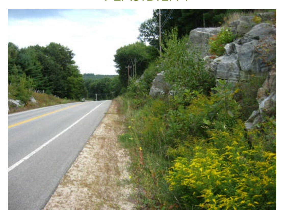
Start of Phase III alignment West side of Moultonboro Neck road