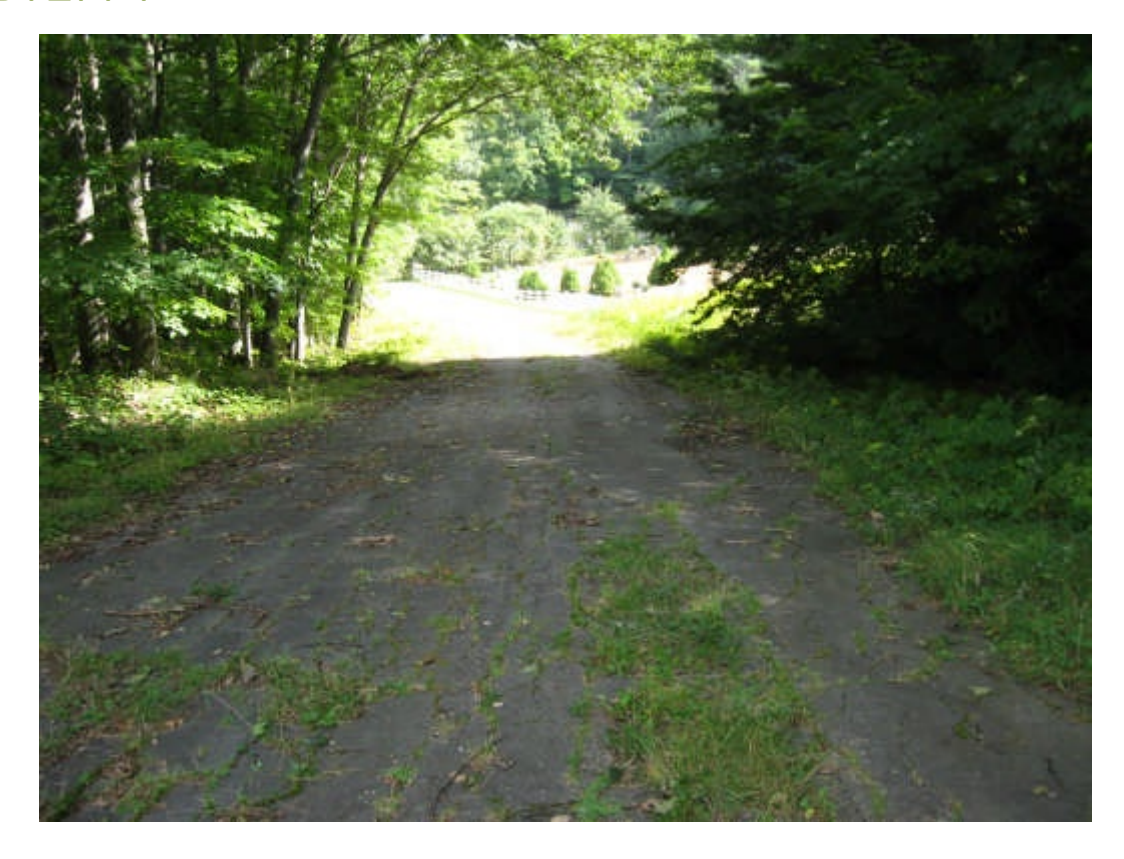
Schoolhouse Hill Road