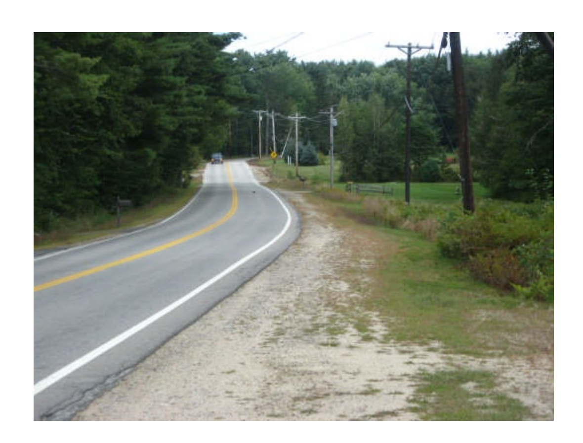
Alignment looking Southerly