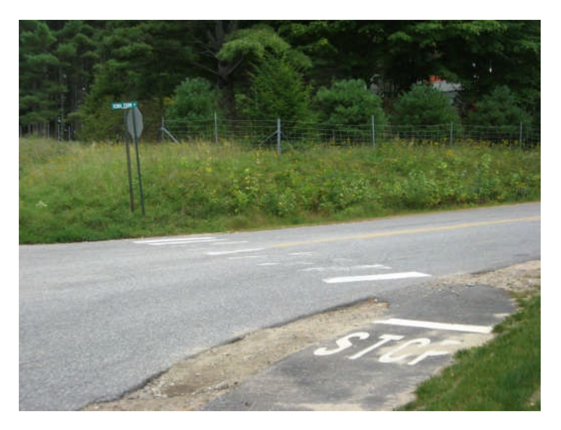
Kona Farm Road. End of Phase II / Begin Phase III