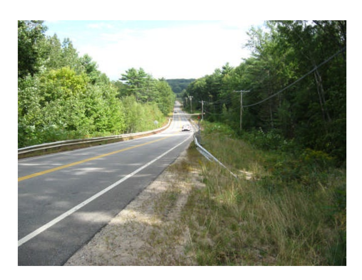
West side alignment