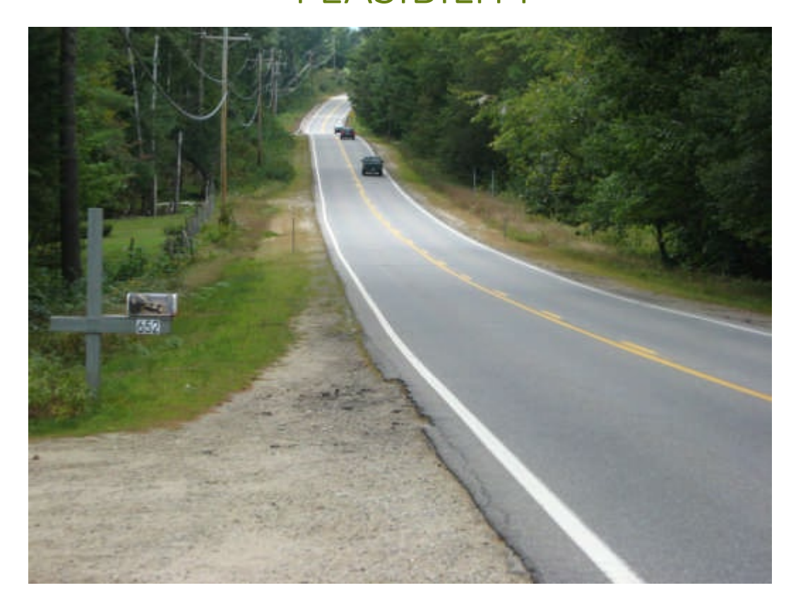
West Side Alignment looking Northerly