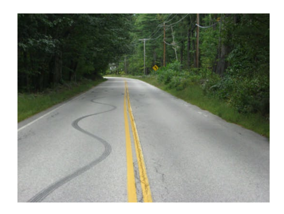
Alignment looking Northerly