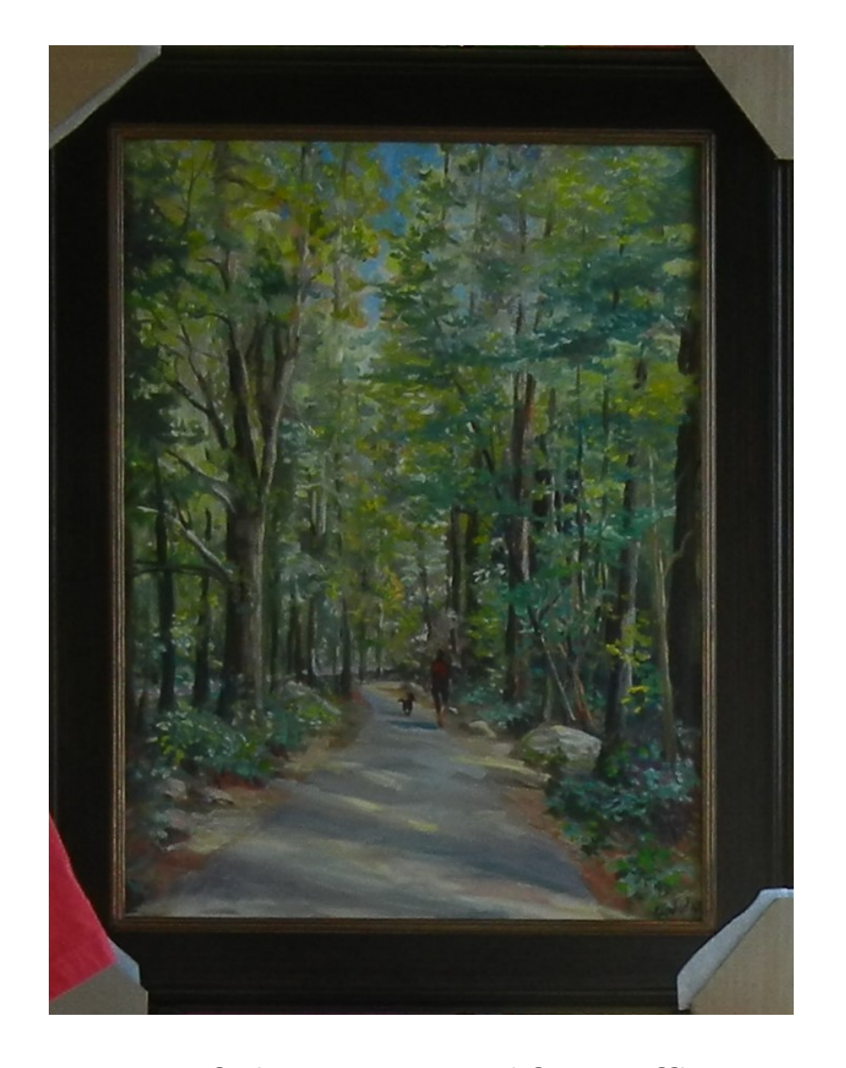
Painting of Phase I - Painted for a raffle prize