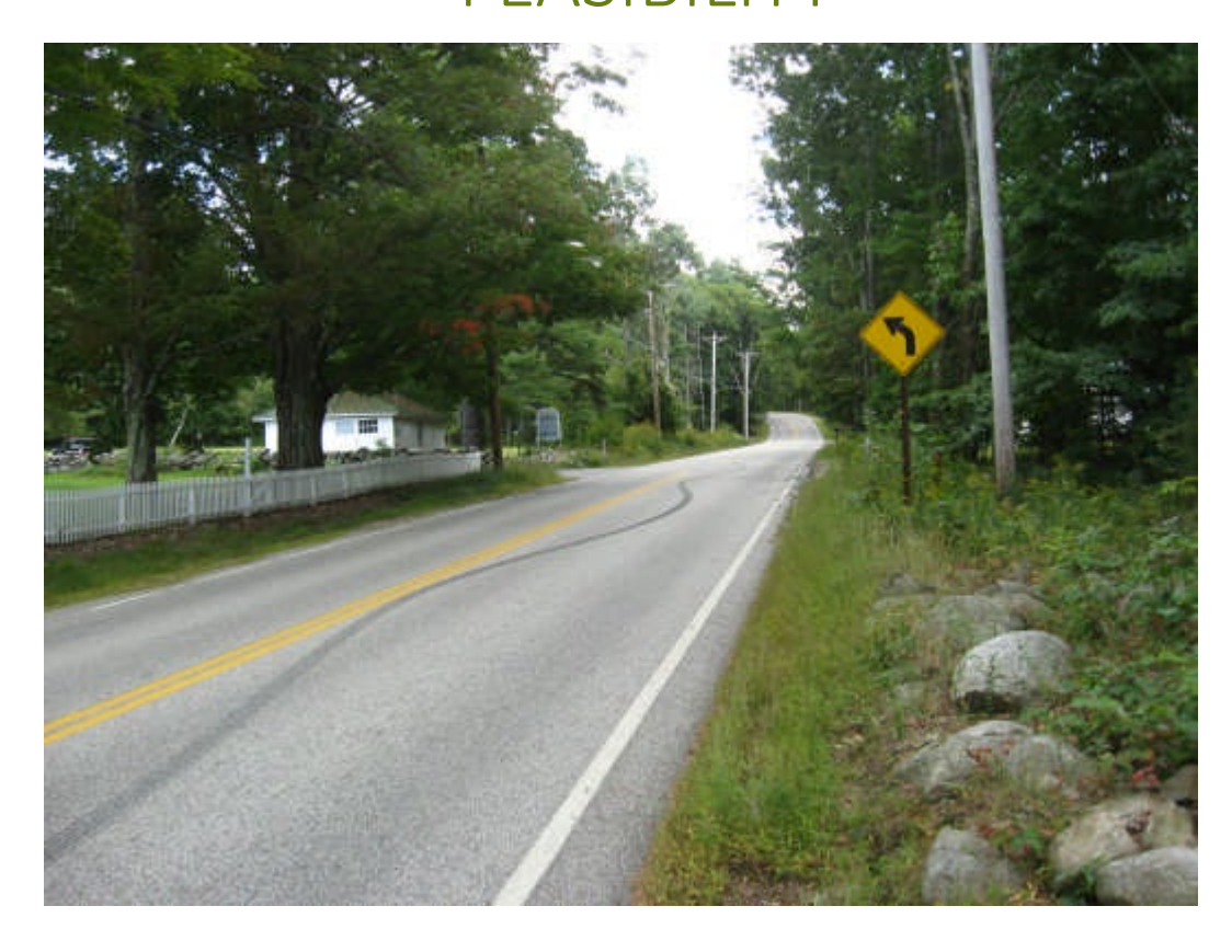
Alignment looking Southerly approaching the terminus at Ferry Road