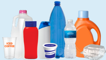
Plastic Bottles, Jugs, Tubs, & Lids (Empty kitchen, laundry, & bath containers & clamshells)