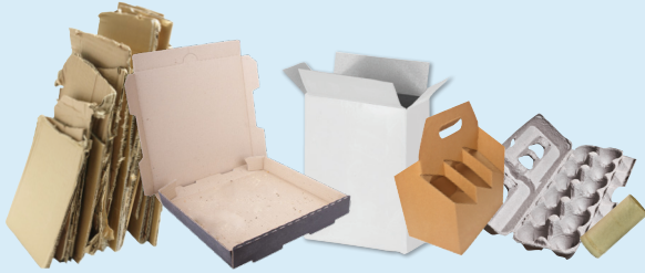
Cardboard & Boxboard (Clean & dry)