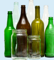
Glass Bottles & Jars (Empty food & beverage bottles & jars)