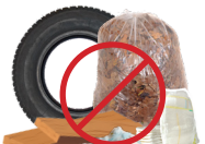
WOOD, WASTE, OR TIRES