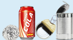
Aluminum & Steel Cans (Foil & empty food & beverage cans)