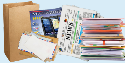
Junk Mail, Periodicals, & Office Paper (Paper bags, envelopes, & catalogs)