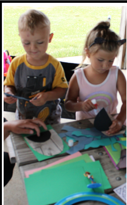
Fun Friday Story Time at Mineral Springs Park had an average of over 40 participants each Friday!