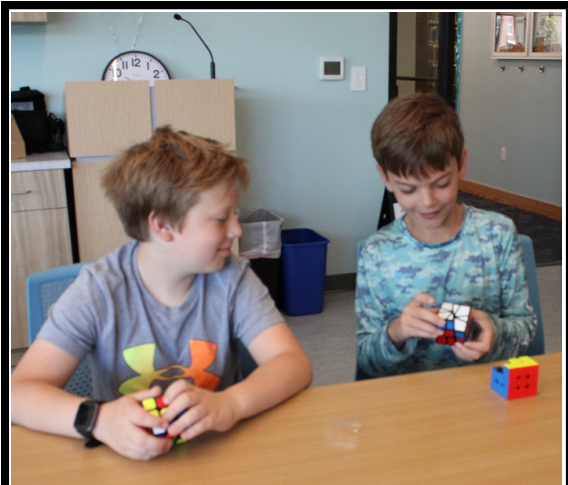
Cubing club taught critical thinking, as well as how to handle frustration! Participants learned how to solve Rubik's most famous puzzle.

This summer the library hosted several new programs in our new youth and program areas. We welcomed the return of Circle Time, our weekly baby and toddler program. Our annual Summer Reading Program had something for everyone of all ages, including crafts, games, Escape Room and Rubik's Cube challenges, Legos and more. We ended the summer with an epic "Under the Sea" party in Mineral Springs Park.