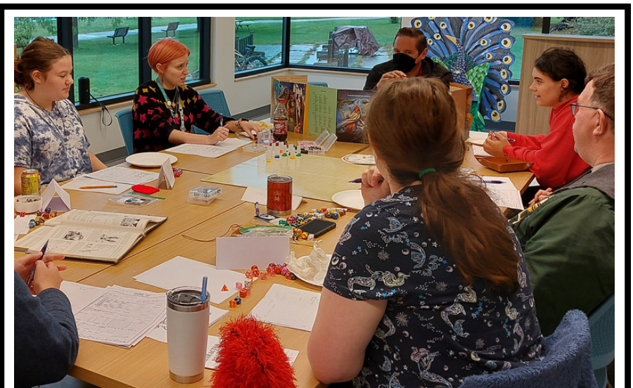
Advanced Dungeons & Dragons has been a wonderful addition to our programming line-up.