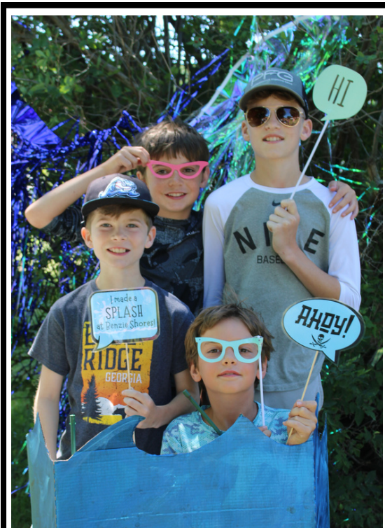
The photo booth made a splash at our "Under the Sea" party, August 2022.