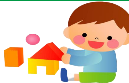
FREE PLAY OR CRAFT