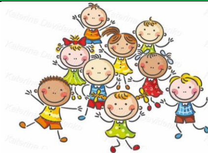
MUSIC ~ DANCE ~ ENERGY