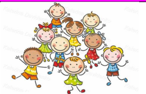
MUSIC ~ DANCE ~ ENERGY