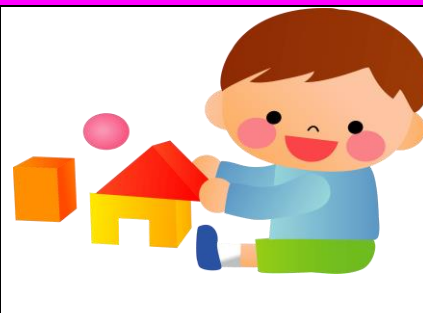
FREE PLAY OR CRAFT