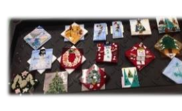
Beautiful fused glass ornaments designed by our adult patrons, who also learned about types of glass and the fusion process