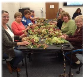
Bemis Hydrangea program

Photos from some of our most recent programs: