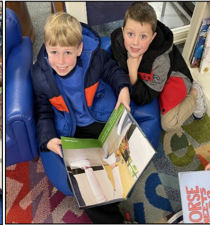
Sharing a book with a friend