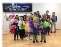
Celebrating New Year's!