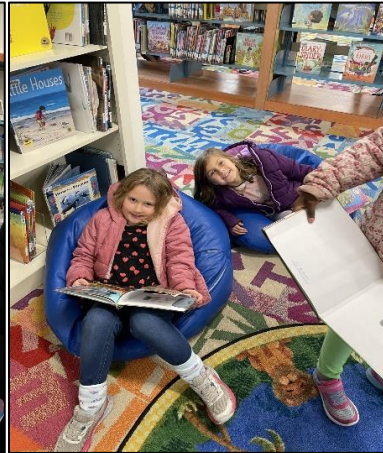
Exploring Vox™ books