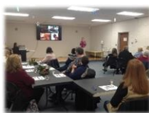
Chocolate tasting and education program