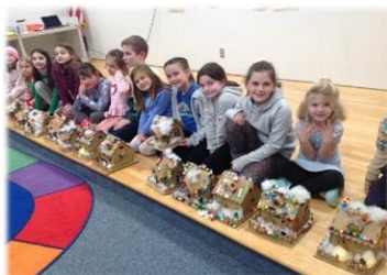
Decorating ginger bread houses: Two sessions both filled to capacity