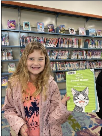
Found just the right book!