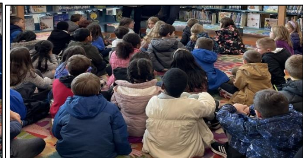
Listening to stories during school visits to the Library