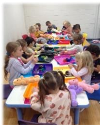
Learning about teddy bears, designing teddy bear outfits, and socializing with a teddy bear picnic