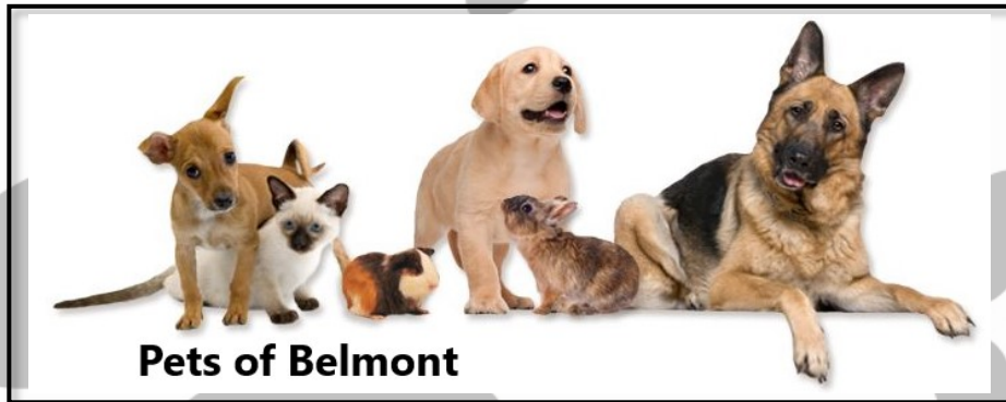
Pets of Belmont