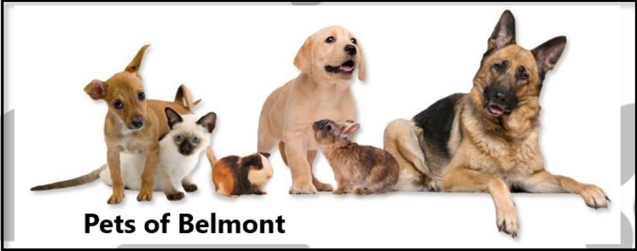
Pets of Belmont