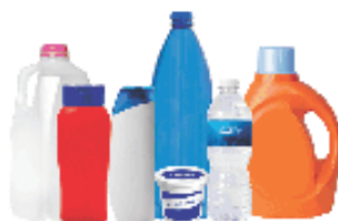
Plastic Bottles, Jugs, Tubs, & Lids (Empty kitchen, laundry, & bath containers)