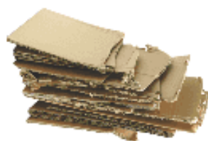
Corrugated Cardboard (Wavy center layer)