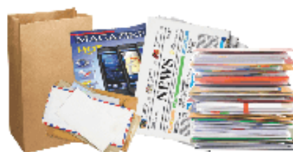
Junk Mail, Periodicals, & Office Paper (Paper bags, envelopes, & catalogs)