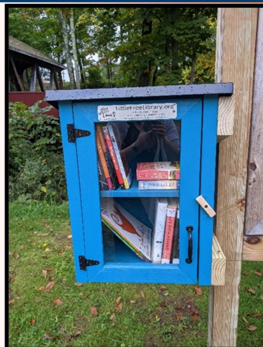
New #littlefreelibraries at the Rail Trail and the Town Forest