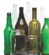
Glass Bottles & Jars (Empty food & beverage bottles & jars)