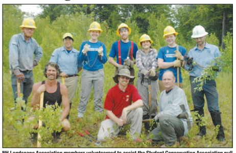
NH Landscape Association members volunteereed to assist the Student Conservation Association pull Buckthorn plants in the summer of 2011.

Belknap Landscape Co, Inc., a member of the New Hampshire Landscape Association or NHLA,