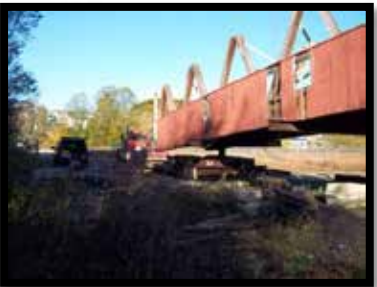
A Pictorial of the Dover Bridge Relocation