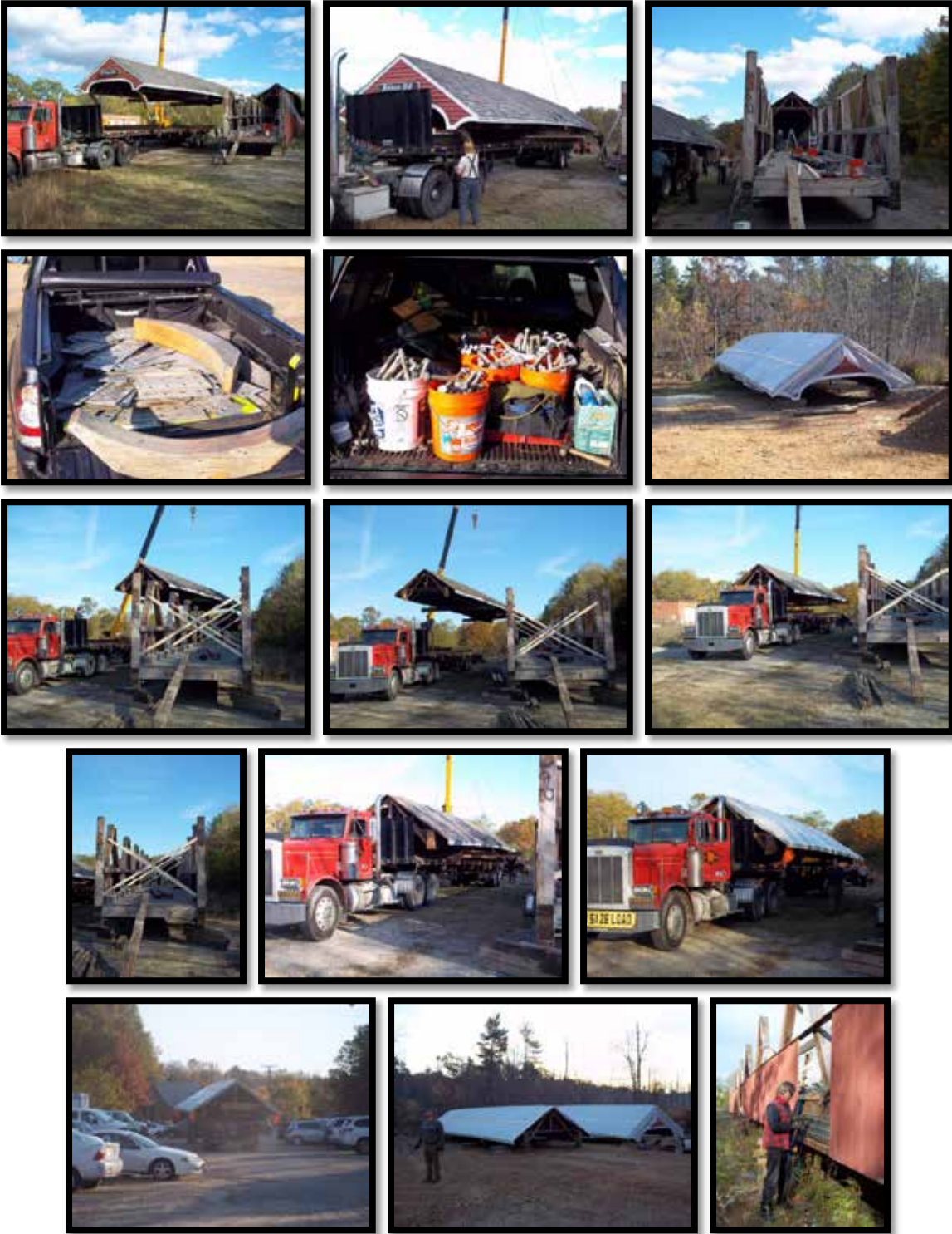
A Pictorial of the Dover Bridge Relocation