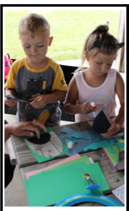
Fun Friday Story Time at Mineral Springs Park had an average of over 40 participants each Friday!