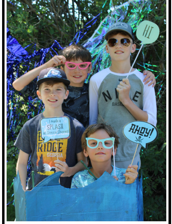
The photo booth made a splash at our "Under the Sea" party, August 2022.