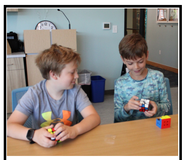
Cubing club taught critical thinking, as well as how to handle frustration! Participants learned how to solve Rubik's most famous puzzle.

This summer the library hosted several new programs in our new youth and program areas. We welcomed the return of Circle Time, our weekly baby and toddler program. Our annual Summer Reading Program had something for everyone of all ages, including crafts, games, Escape Room and Rubick's Cube challenges, Legos and more. We ended the summer with an epic "Under the Sea" party in Mineral Springs Park.