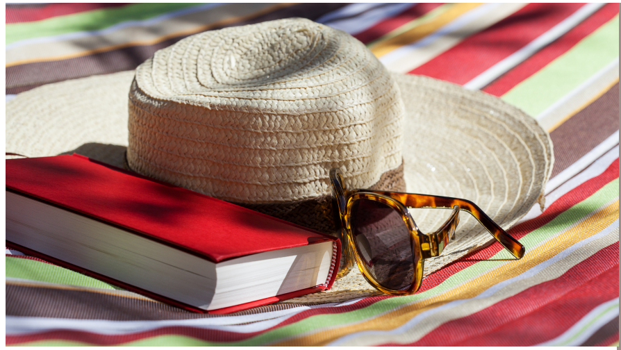
Two-For-One Book Review