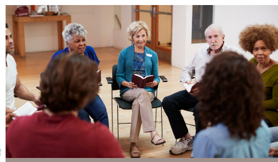
Classic Book Club *Registration Required*