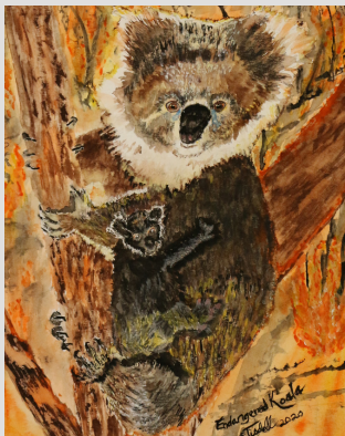
Endangered Koala by Anne Tisdell See page 4

Local History and Museum Highlights Page 5