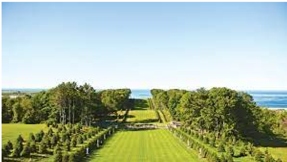
The Grand Allee at Castle Hill on the Crane Estate, Ipswich, MA

One of the latest additions to our pass program at the Gale Free Library, The Trustees of Reservations is not one museum or location, but many! The Trustees care for more than 100 properties on roughly 47,000 acres in Massachusetts. Our Trustees GO Pass admits patrons at the Family Membership Level--free or reduced admission for 2 adults and children under 18--to Trustee properties throughout Massachusetts, including Fruitlands Museum in Harvard, Castle Hill on the Crane Estate in Ipswich, deCordova Sculpture Park and Museum in Lincoln, and Naumkeag in Stockbridge! See The Trustees website ( thetrustees.org ) for a complete listing, or pick up a property map and pass at the Reference Desk.