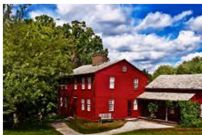
Fruitlands Museum, Harvard, MA

Passes to the featured museums and others are available at the Reference Desk or by calling 508-210-5569.