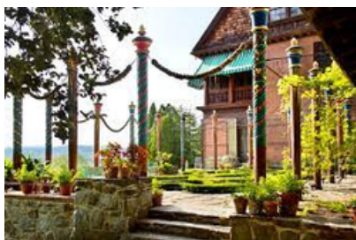
Naumkeag, Stockbridge, MA

One of the latest additions to our pass program at the Gale Free Library, The Trustees of Reservations is not one museum or location, but many! The Trustees care for more than 100 properties on roughly 47,000 acres in Massachusetts. Our Trustees GO Pass admits patrons at the Family Membership Level--free or reduced admission for 2 adults and children under 18--to Trustee properties throughout Massachusetts, including Fruitlands Museum in Harvard, Castle Hill on the Crane Estate in Ipswich, deCordova Sculpture Park and Museum in Lincoln, and Naumkeag in Stockbridge! See The Trustees website ( thetrustees.org ) for a complete listing, or pick up a property map and pass at the Reference Desk.