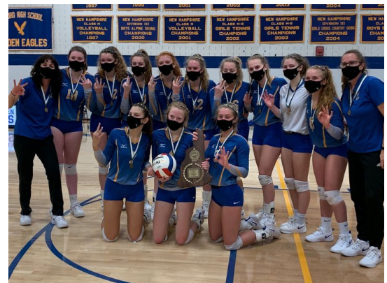
2020 Division II Volleyball Champs

Students will return to in-person instruction (for those that are in-person) on 12/7.