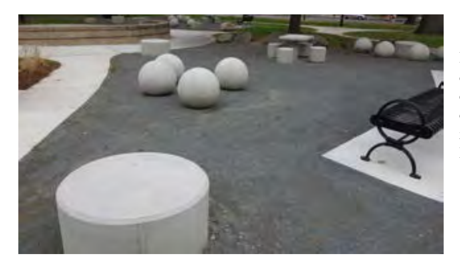
Have a seat on our new benches. Play checkers, chess, or dominoes on one of the tables in the park. Bring your own game or take out any of the other numerous board games available at the Library.