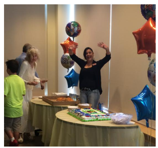
Celebrating in the Community room with library staff!

We also celebrated at the Holyoke Merry Go Round. <u>Thank you</u> to all of the kids who participated in the Summer Reading program and the grownups who brought them to the library!