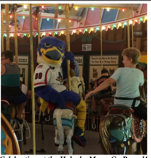
Celebrating at the Holyoke Merry Go Round!