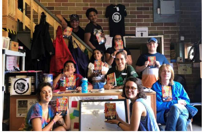
Bikes and Books participants with their books.

Teen summer programs, which would not be possible without your support, were also well attended. In the <u>Bikes and Books</u> program that was a collaboration between the Teen Room and HUBS, the kids finished the book (The Epic Fail of Arturo Zamora). they had weekly discussions about the themes of the book, which included gentrification, family, youth leaderships, and community activism). The teens also went for rides throughout the community, and even rode to all the way to a park in Chicopee!