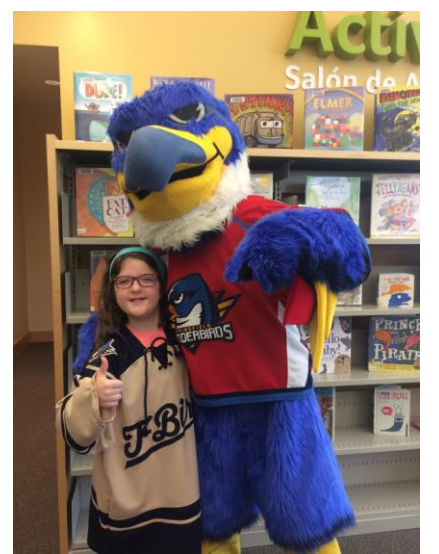
Happy Reader with Screech in the Children's rm.