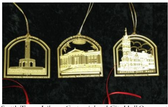
Scott's Tower, Library Centennial and City Hall Ornaments