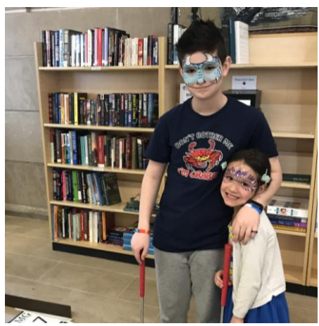
Fun and Face paint at the library!

On Saturday April 6<sup>th</sup>, the library hosted the Fourth Annual Mini Golf in the Library fundraiser . Over 350 players registered for mini golf during the day -- our best turnout ever! Additional people (parents, grandparents) accompanied the youngest players, and others came and watched. We enjoyed seeing so many happy faces and hearing praise for the creative decorations (and obstacles) along the course. Thanks to all of the sponsors, donors and volunteers who contributed to the success of this event!