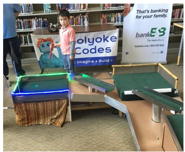
Playing at the animated hole designed by Holyoke Codes.

On Saturday April 6<sup>th</sup>, the library hosted the Fourth Annual Mini Golf in the Library fundraiser . Over 350 players registered for mini golf during the day -- our best turnout ever! Additional people (parents, grandparents) accompanied the youngest players, and others came and watched. We enjoyed seeing so many happy faces and hearing praise for the creative decorations (and obstacles) along the course. Thanks to all of the sponsors, donors and volunteers who contributed to the success of this event!