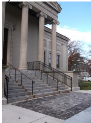
Original Maple St Entrance with brick patio.