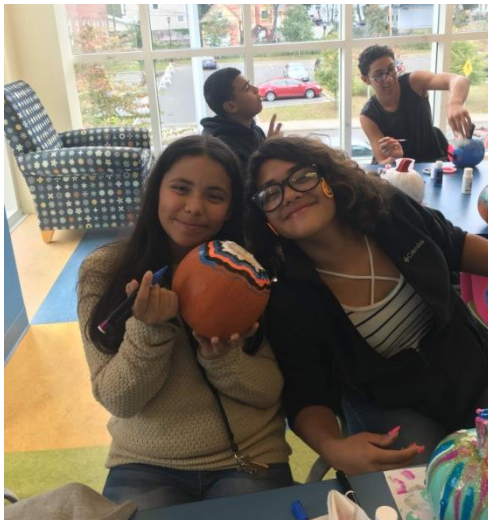
Happy Teens working on their pumpkins!

The library hosted a free 4H Babysitters Training Course over the course of two Saturdays in November. The class had a huge turnout, and youth learned how to start their own babysitting business and keep children safe and entertained, among other things. Due to popularity and a wait list, we are hoping to offer the course again in the Spring.