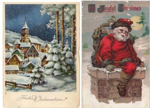
from the History Room's historic postcard collection

The Holyoke History Room collection continues to grow. We have recently finished processing the Blanche Cavanaugh Historic Postcard Collection, with more than 800 items.