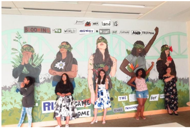
The five teen artists portrayed in the mural.

-Each of the flowers/ plants have a different meaning and were selected by the girls during the brainstorming process. The flowers are from different places around the world. Mostly from tropical places except the one in the center which is a native flower of MA. They are all connected thru their roots like the people are all connected.