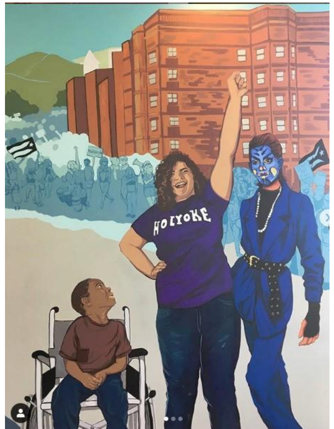
People from all walks of life coming together to protest!