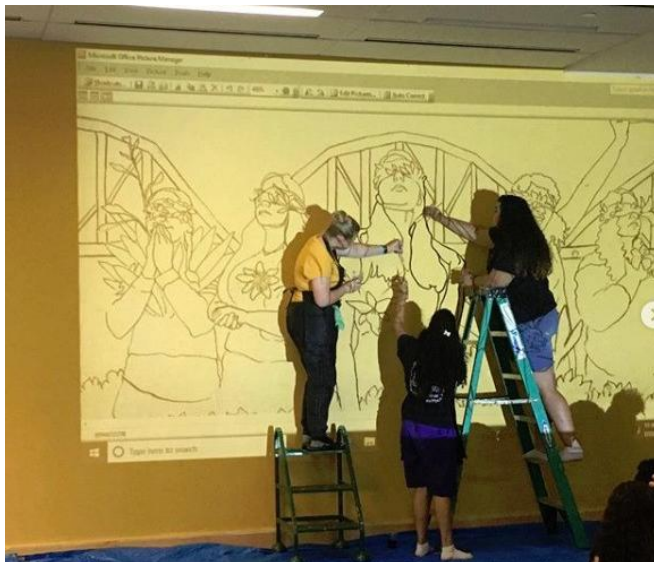
Artists and youth tracing while the design was projected.

Once the design process was complete, they moved on to the painting process which included prepping the wall with a base coat and then projecting the design on the walls to trace out the outlines.