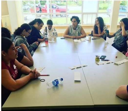
Day 1- Artists and youth brainstorming ideas.