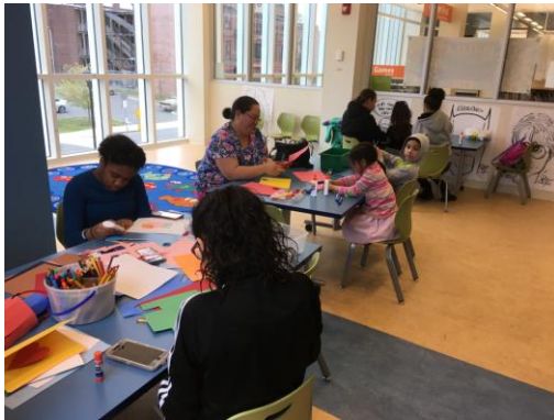
Patrons enjoying Craft making event.

It officially began on Monday, July 1st and was open to students grades K-8. Every Friday from July 5th until August 2nd children could bring in their completed reading log to receive a small weekly prize. Every Week, there were a variety of programs for all ages.