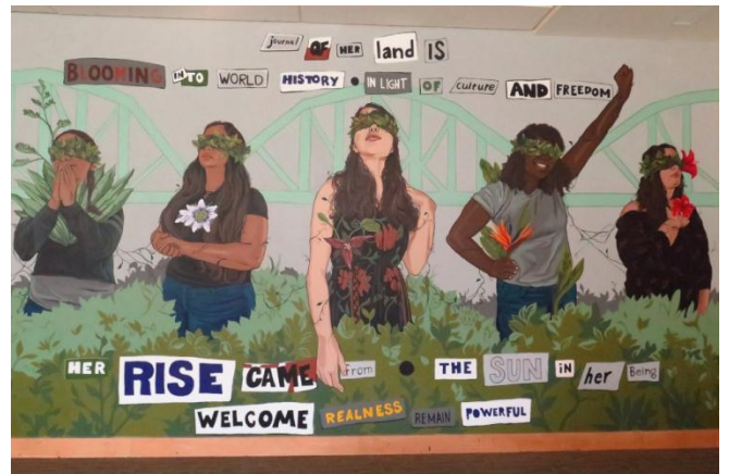
The completed design.

The First Mural is in the Community room.