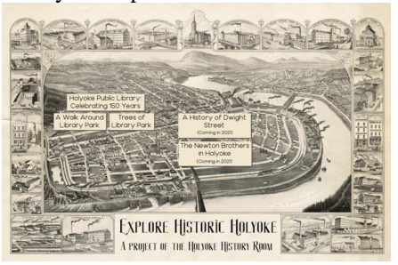
Made possible by a grant from the Massachusetts Board of Library Commissioners.

The Holyoke History Room's Virtual and Mobile Tours are still available! The first two walking tours of Explore Historic Holyoke (<a href="www.holyoke.oncell.com">www.holyoke.oncell.com</a>) introduce the historic buildings around Library Park and the trees on the grounds. Enjoy—and use Visitor Feedback page to tell us about your experience.