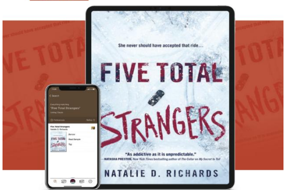
She thought being stranded was the worst thing that could happen. She was wrong.

Join others from around MA and the world from Nov 1-15 use #biglibraryread on social media for a chance to win prizes including a tablet!