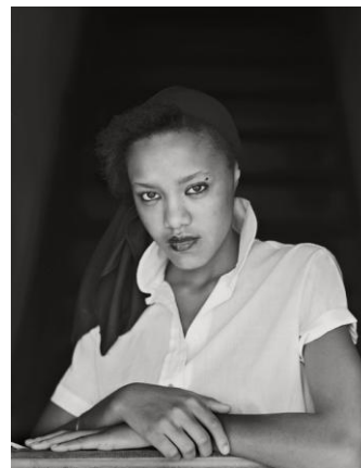
Photo from May 2022 exhibit: "La ciudad en papel: Representaciones de la vida HolyoRícan"