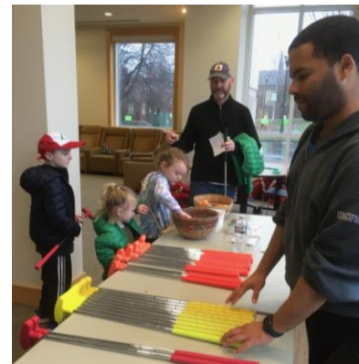
Let's get our equipment!