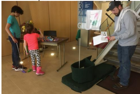
Hole 17- get your Hole in One prize!

“Mini Golf and Games at the Library!” –a series of FUN activities inside and outside of the Holyoke Public Library was held on Saturday, April 9.