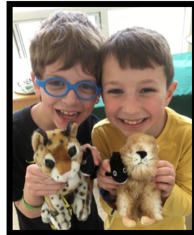
19 th Hole Winners

Over 300 people of all ages participated in Mini Golf and Games by playing 18 holes of miniature golf inside the building and Foosball outside!