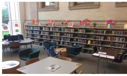
One of the best parts of the Holyoke Library is our Teen Room. It is a space that teens may truly call their own and express themselves.