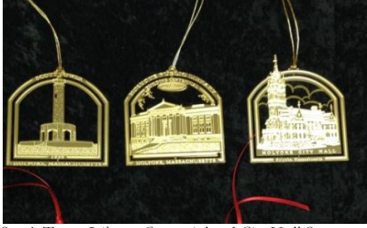
Scott's Tower, Library Centennial and City Hall Ornaments