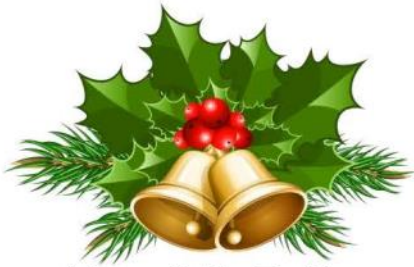
A Bourne Holiday Tradition