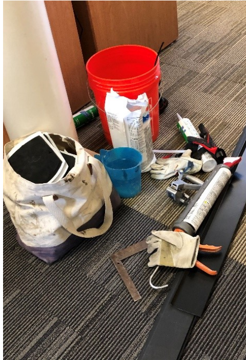
Tools of the trade