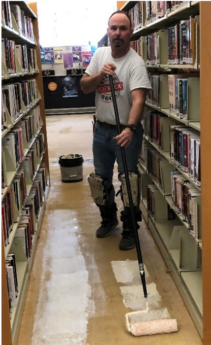
Preparation of the floor