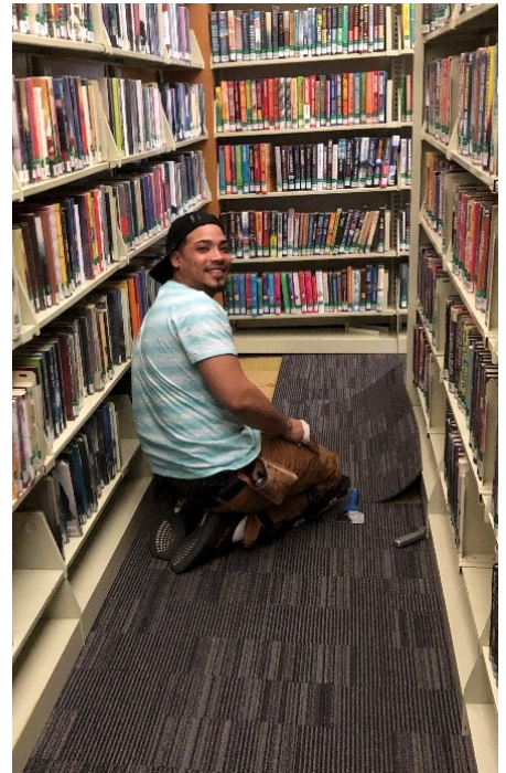
Installing the new carpet

The walls of the Library were ringing with construction noise at the start of March. A crew of carpet installers were hard at work bringing a new life to the floor of our Library.