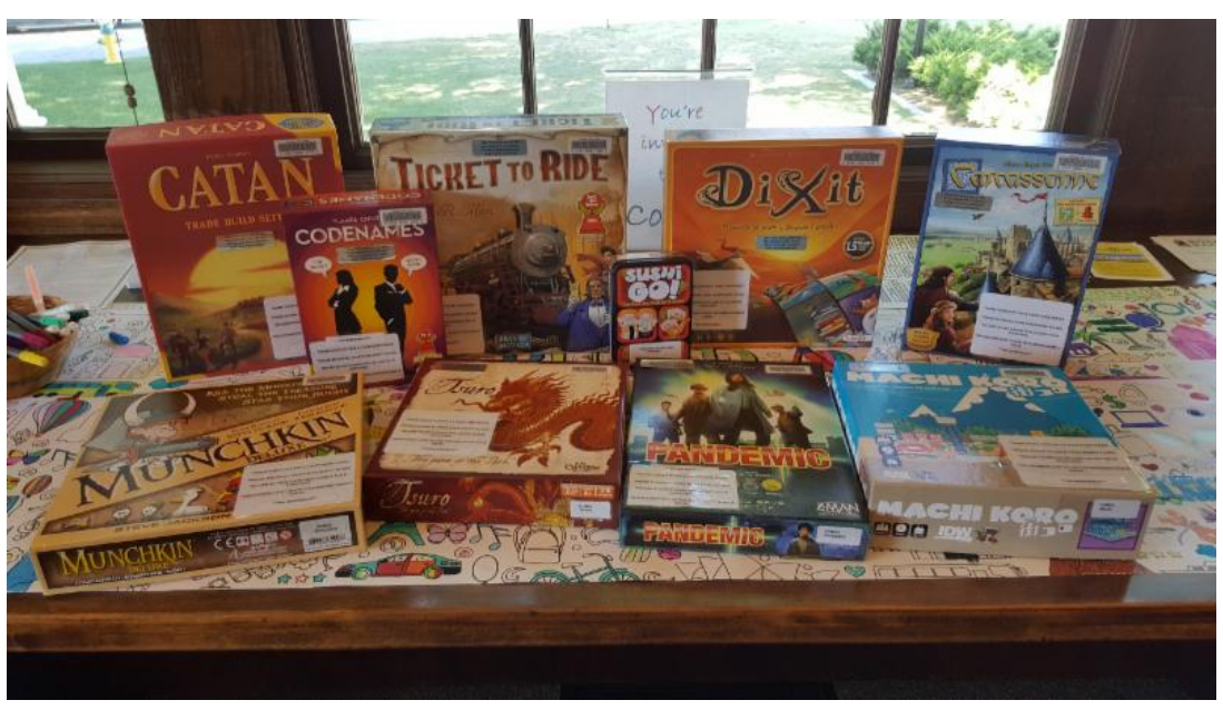
Board and Card games now available for checkout. Stop by to browse our collection (near the jigsaw puzzles) and take one home.