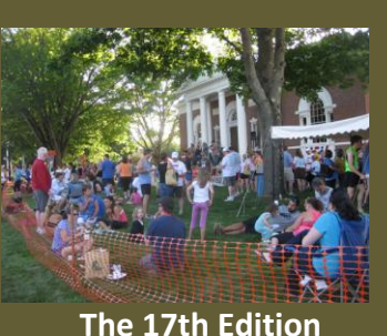
The 17th Edition Road Race

program at Saint Anselm College in Manchester, NH. His research focuses on quantum information, complexity theory, the foundations of quantum mechanics and cosmology, and anything else that piques his interest. He is a member of the Foundational Questions Institute and serves as secretary