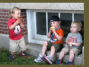
Our Youngest Road Race Participants!