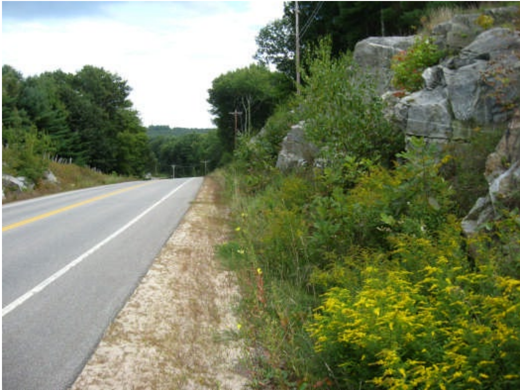
Start of Phase III alignment West side of Moultonboro Neck road