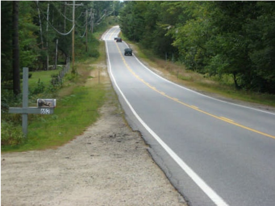
West Side Alignment looking Northerly