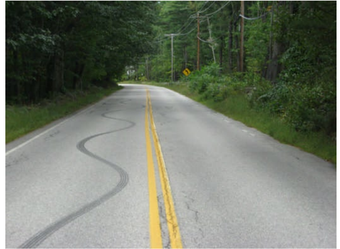
Alignment looking Northerly