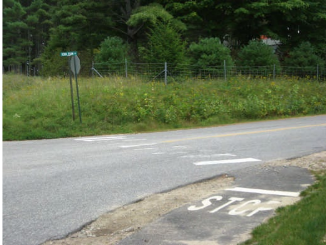
Kona Farm Road. End of Phase II / Begin Phase III