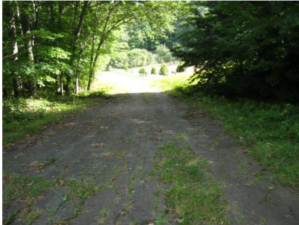
Schoolhouse Hill Road