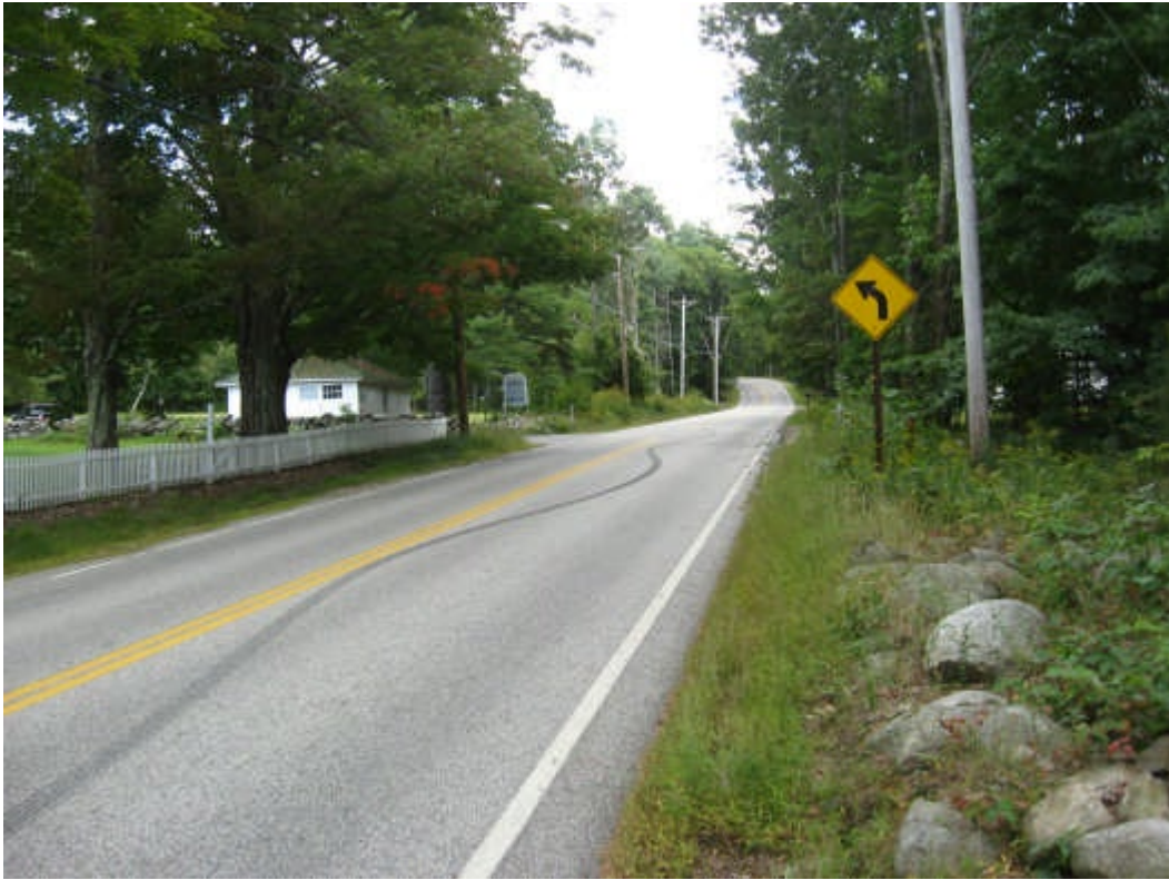
Alignment looking Southerly approaching the terminus at Ferry Road