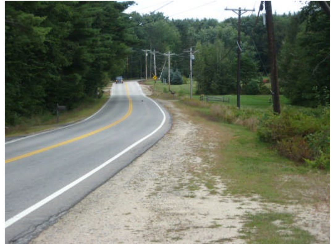
Alignment looking Southerly