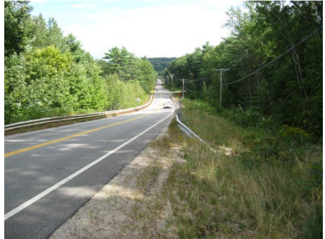
West side alignment