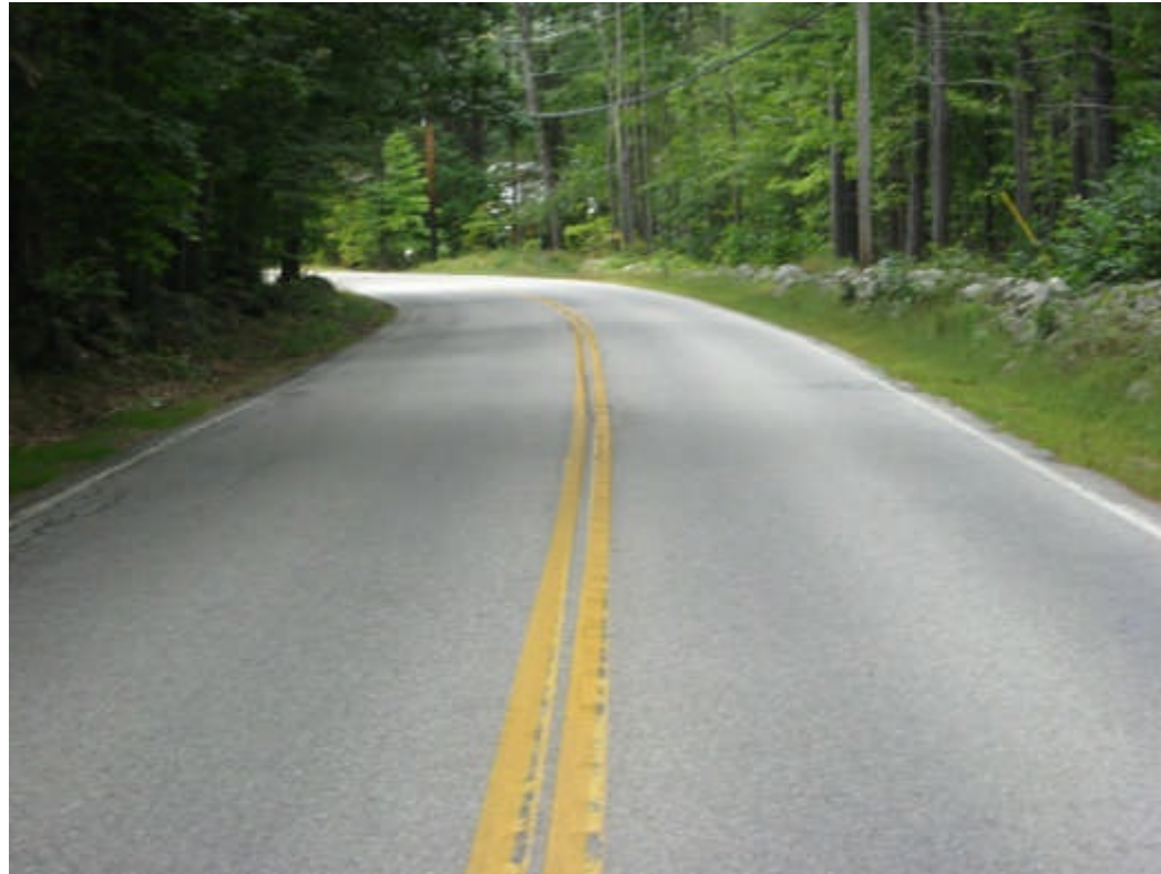
Critical Section: Limited sight distance; stone walls; trees