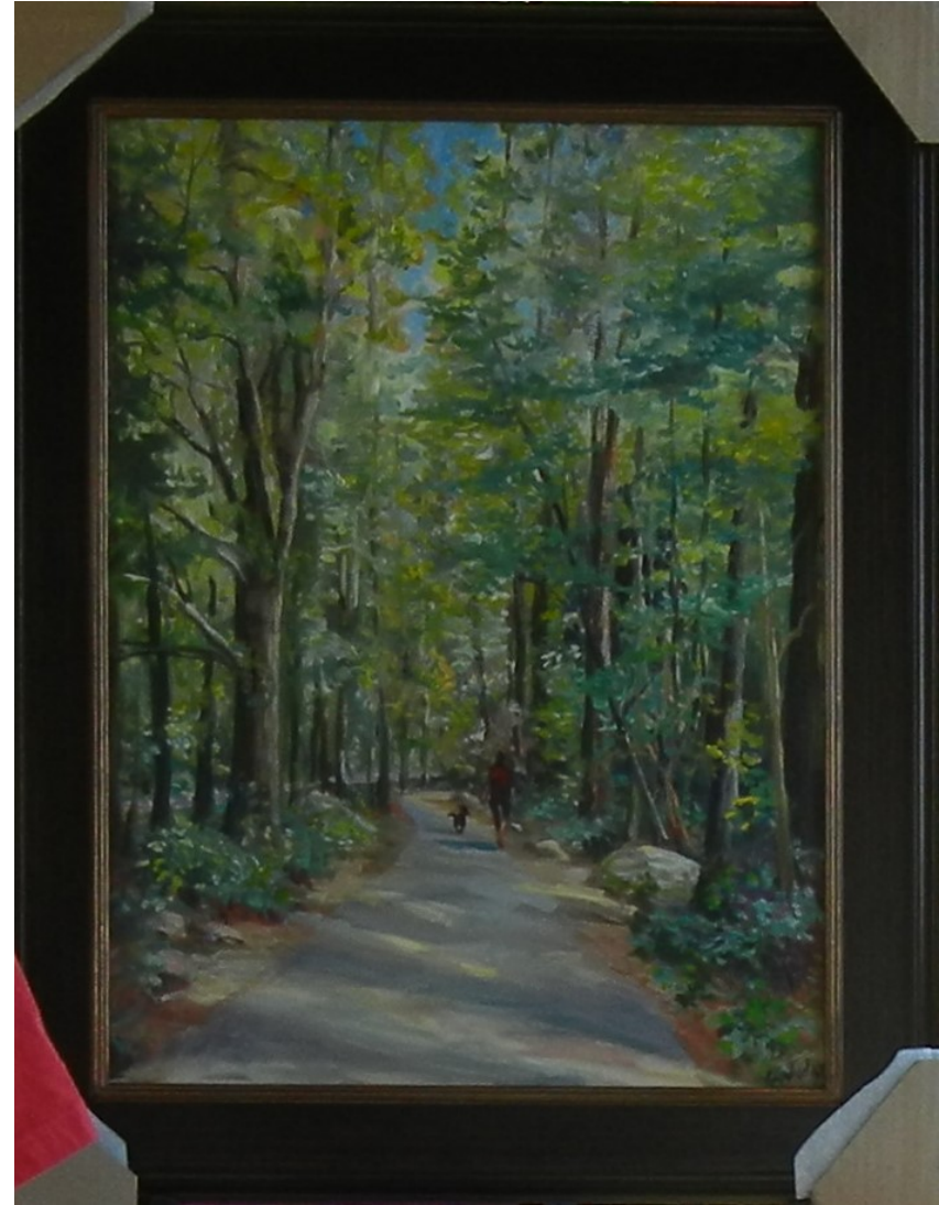
Painting of Phase I - Painted for a raffle prize