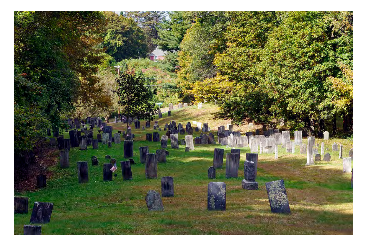
View west from center of cemetery