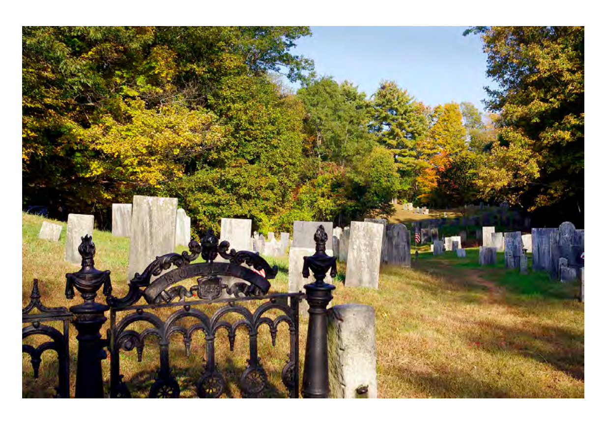
The Bodman gate at the cemetery entrance