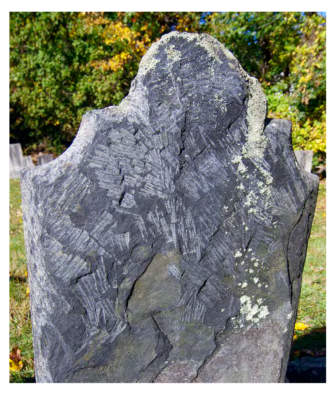
Marks of the carver's chisel on the rough back of a stone