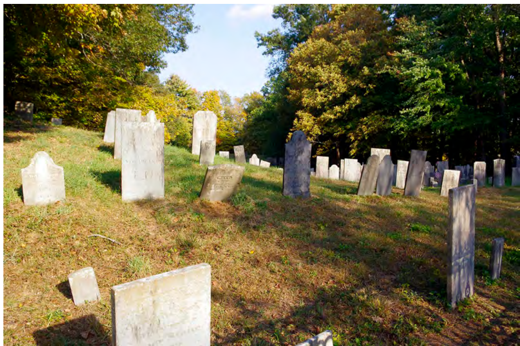
Planned as a walking tour, rained out twice and finally delivered as an illustrated indoor talk