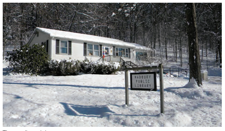
The small ranch house which has served as Madbury's library since 2003

Pounded in 1775, Madbury is a small town located in the southeastern section of New Hampshire; its population is approximately 2000. Madbury is governed by an elected board of selectmen and the annual town meetings are well attended and spirited. Residents enjoy the natural beauty and rural character of the town and there is a strong tradition of volunteerism with citizens participating in many civic organizations and town boards.