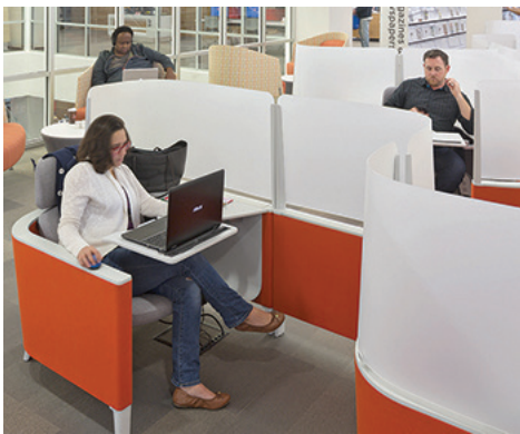
Dividers encourage physical distancing. Tulsa City-County (Okla.) Library