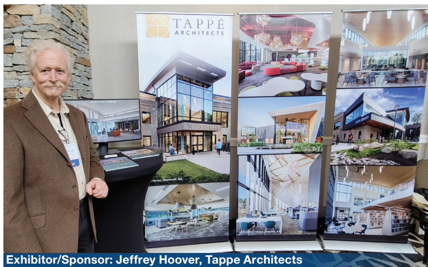
Exhibitor/Sponsor: Jeffrey Hoover, Tappe Architects