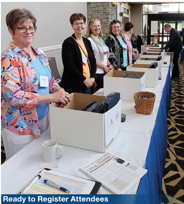
Ready to Register Attendees