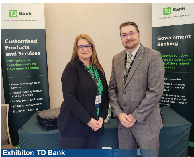
Exhibitor: TD Bank