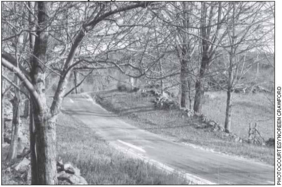
"Stone Walls on Oxbow Road"