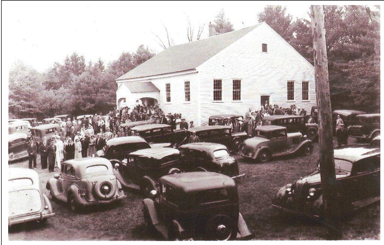
Dana Meeting House, Built in 1801 * New Hampton, New Hampshire