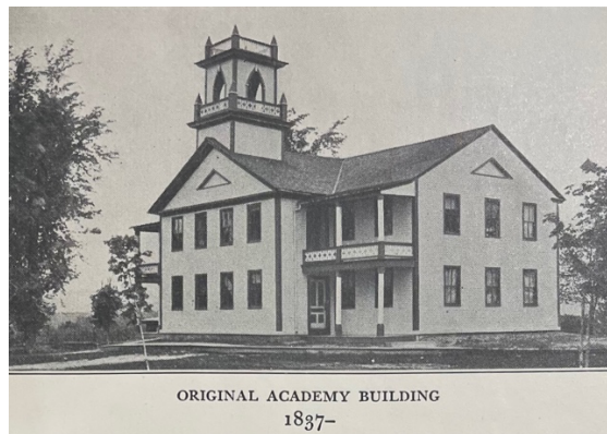
ORIGINAL ACADEMY BUILDING 1837-